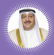
HE. DR. AHMAD ABDEL WAHAB AL AWADHI MINISTER OF HEALTH KUWAIT