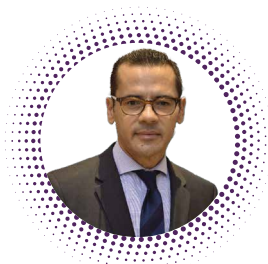
MP. FADI ALAME PRESIDENT ARAB HOSPITALS FEDERATION

We hope to meet you all on 25 - 26 September at the 24th edition of Med Health Forum 2023!