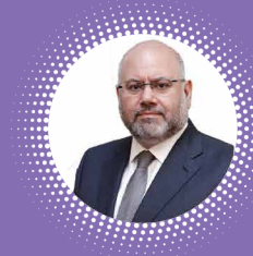
HE. DR. FIRASS ABIAD MINISTER OF PUBLIC HEALTH LEBANON