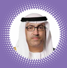
HE. DR. ABDUL RAHMAN AL OWAIS MINISTER OF HEALTH AND PREVENTION UAE