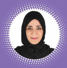
DR. AYSHA AL KHOORI DEPARTMENT OF HEALTH - ABU DHABI UAE